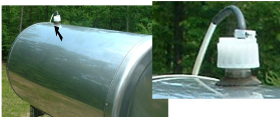
Install Sensor Vertically