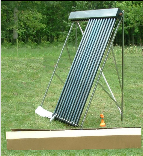
60° Collector frame

Keep the tubes covered in box before installing or the condenser will expand. They are quick to heat up.